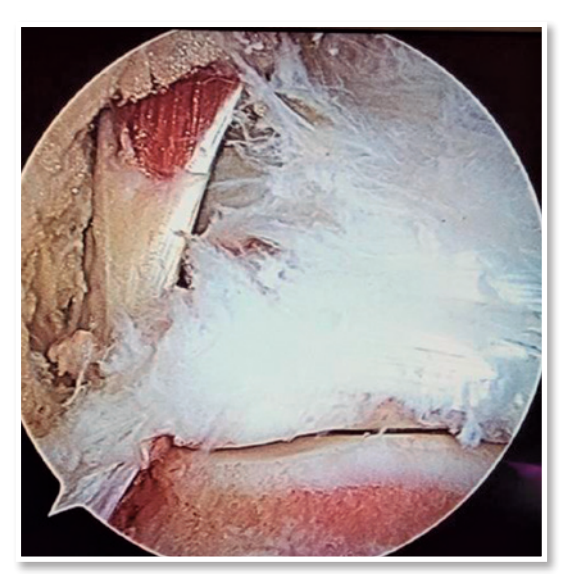
Figure 2 | Flexor hallucis longus: identification after debridement.

The flexor hallucis longus tendon is a deep structure, except at the level of the hallux. Its route can be divided into three zones. Zone 1 is located posterior to the ankle. In zone 2, the pathway of the flexor hallucis longus tendon starts in the osteofibrous tunnel formed at the level of the posterior talar tubercles, passes under the sustentaculum tali, and ends at the level of the knot of Henry. The portion of the flexor hallucis longus tendon distal to the knot of Henry is located in zone 3, up to its insertion in the distal phalanx of the hallux<sup>(13)</sup>.