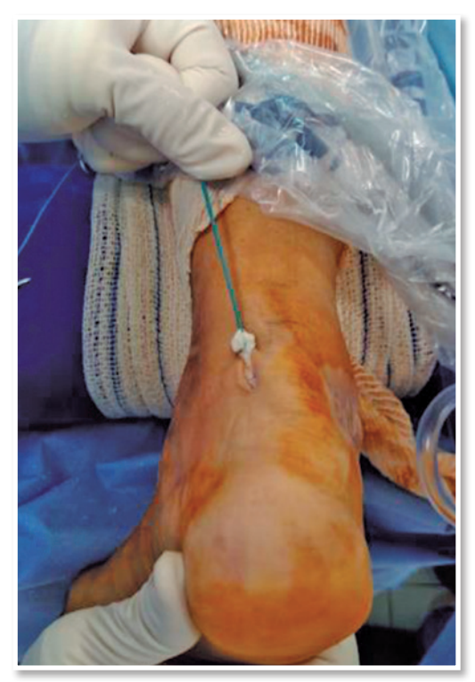
Figure 4 | Free stump of the flexor hallucis longus externalized through the medial portal with Krakow sutures.