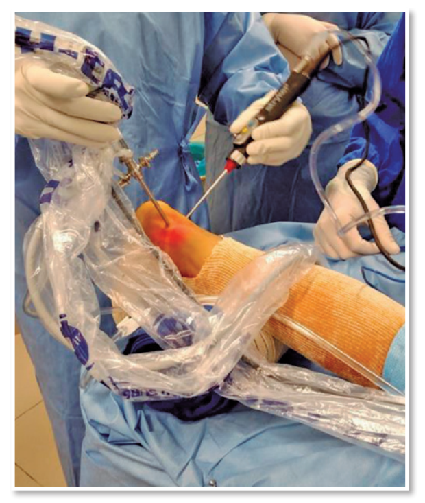
Figure 1 | Posterior ankle endoscopy.

We performed posterior ankle endoscopy using the posterolateral and posteromedial portals as described by van Dijk<sup>(12)</sup> (Figure 1).