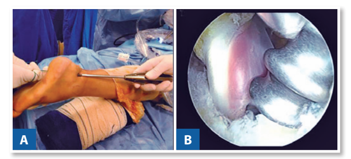
Figure 6 | A) External visualization of the introduction of the interference screw. B) Endoscopic visualization of the tunnel with the flexor hallucis longus tendon and the interference screw.

equinus), and the appropriate tension in the flexor hallucis longus was checked through the traction of the non-absorbable suture wire. After confirming adequate tension, by restoring anti-gravity equinus, the flexor hallucis longus tendon was fixed to the bone tunnel using a metal or absorbable interference screw (7/25mm) (Figure 6). When necessary, the calcaneal tendon gap was sutured using the PARS technique (Arthrex, USA) to bring the tendon stumps together.