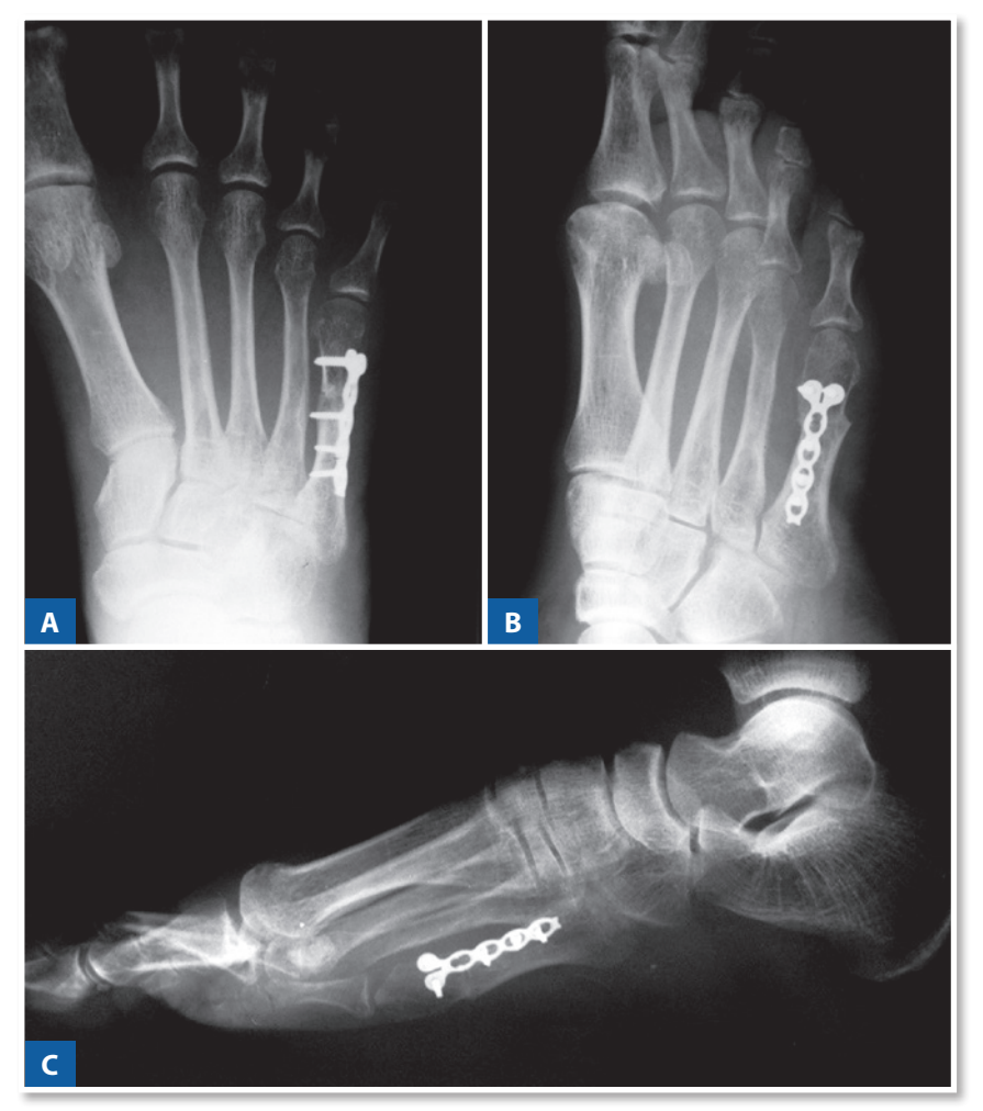
Figure 4 | Late postoperative radiographs of consolidated osteotomy and non-recurrence.