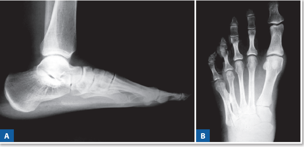
Figure 2 | Preoperative radiographs.