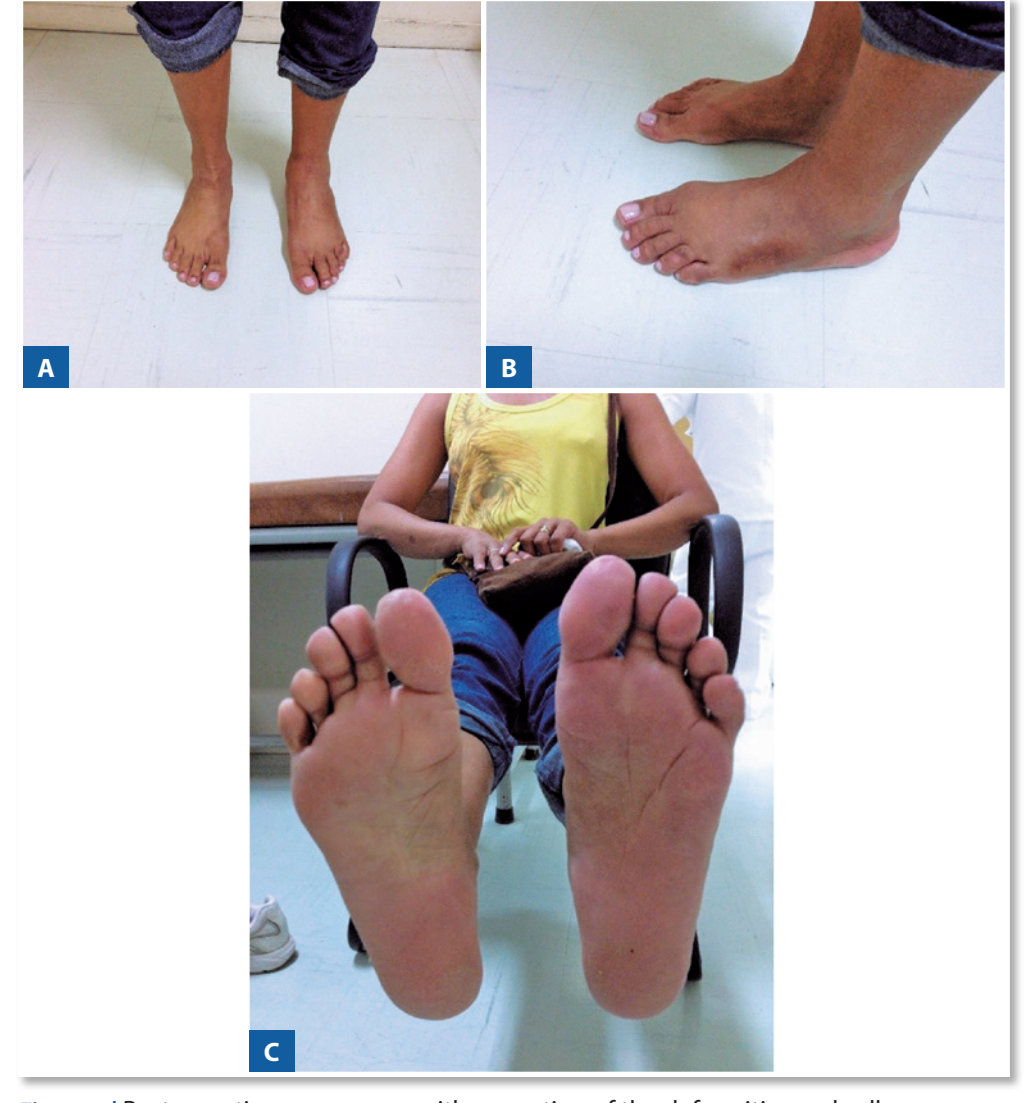
Figure 5 | Postoperative appearance with correction of the deformities and calluses.

Congenital osseous coalitions in the foot are relatively uncommon, present in 1-2% of the population. However, since they are asymptomatic in most people, the true prevalence is probably higher<sup>(4,8)</sup>. The most common bars that are extensively described in the literature occur between the tarsal bones, typically in children, with calcaneonavicular and talocalcaneal bars being the most common, accounting for more than 90% of cases<sup>(1,3,6,8)</sup>. Other less common bars include the calcaneocuboid, cuneonavicular, cuboid-navicular<sup>(2)</sup> and metatarsocuboid types<sup>(9)</sup>. Intermetatarsal coalitions are rare, so there are few cases described in the global