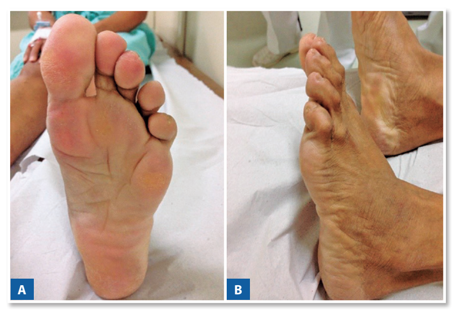
Figure 1 | Preoperative physical examination.

The patient was discharged after 24 hours wearing a cast boot without support. The outpatient return visit took place after one week for Barouk shoe fitting. The stitches were removed at three weeks, and the patient was authorized to start bearing weight in the sixth week following control radiographs confirming osteotomy consolidation (Figures 4A, B and C). At twelve months, the patient retur-