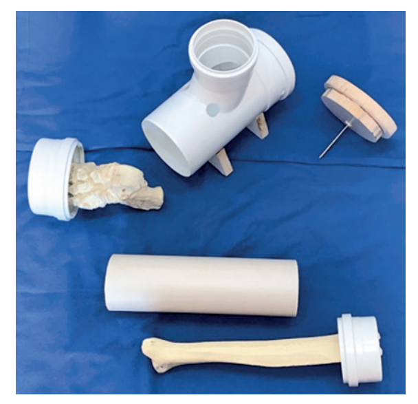
Figure 2. Components of the ankle model.