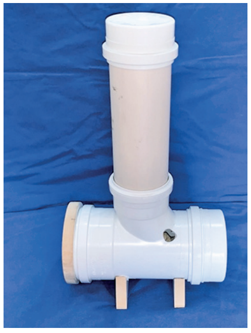
Figure 4. Ankle model - side view.

Table 1. Costs for making an arthroscopy simulator