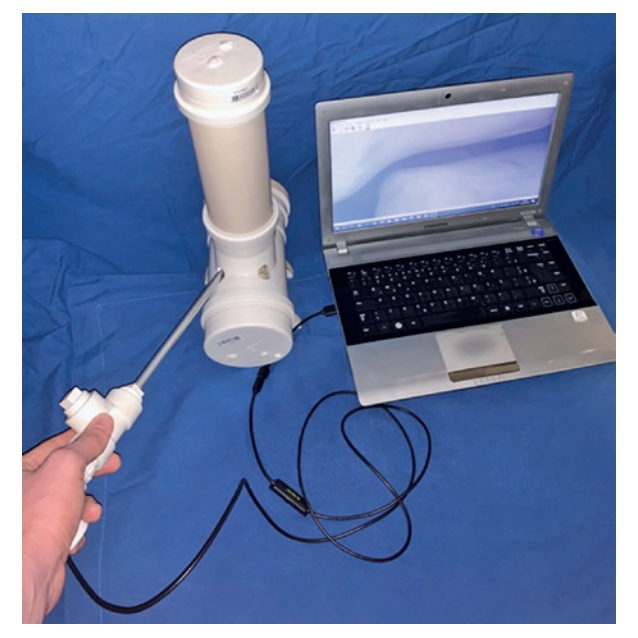
Figure 5. Final simulator kit in use.