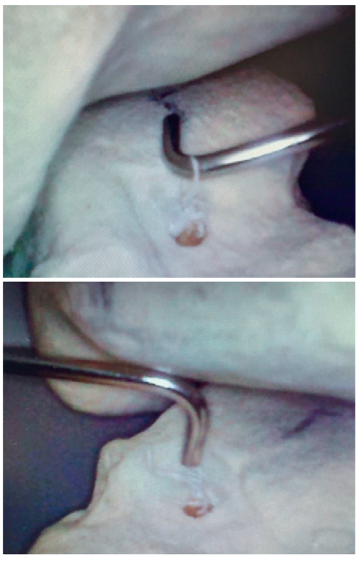
Figure 6. Triangulation.

The surgical technique initially developed through large incisions and direct visualization of the anatomical structures. With advances in research and technology, traditional open surgery was found to lead to high morbidity and greater risks to patients; therefore, the concept of minimally invasive surgery was developed and then disseminated worldwide. Within the context of orthopedics, intra-articular injuries were most favored by minimally invasive procedures. With the development of arthroscopy using small incisions and indirect visualization, the surgeon was able to visualize the structures on a screen. The technique requires additional training to obtain visuospatial coordination for interpreting three-dimensional structures on a two-dimensional image<sup>(5)</sup>. It also requires triangulation, which is the meeting of the arthroscope and instruments within a joint<sup>(10)</sup>.