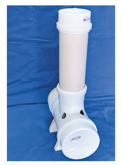
Figure 3. Ankle model - front view.