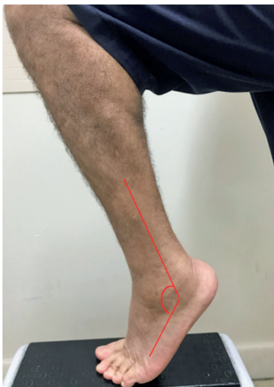
Figure 3. Evaluation of ankle plantar flexion in weight-bearing closed chain test. Hip and knee in flexion with body weight on the evaluated limb, with the patient on the tips of his toes. The red line shows the angle used to measure the range of motion.