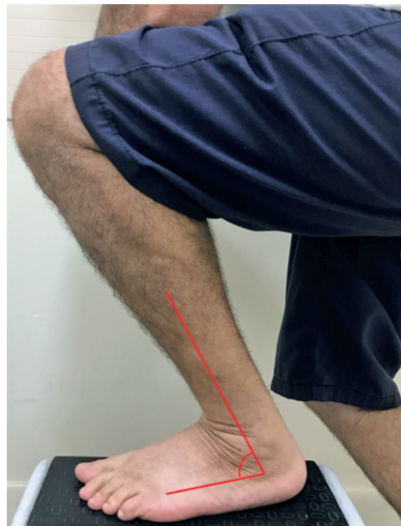
Figure 2. Evaluation of weight-bearing closed chain ankle dorsiflexion. Hip and knee flexed with body weight on the evaluated limb. The red line shows the angle used to measure the range of motion.