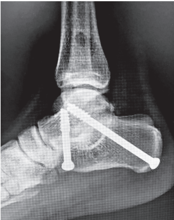
Figure 1. Lateral ankle radiograph showing subtalar joint arthrodesis.

and open chain with weight-bearing, comparing the operated side with the contralateral side, which served as a control. To measure the range of motion of weight-bearing closed chain dorsiflexion (MDF), the patient was positioned standing with one foot on the floor and the foot to be examined on a bench about 30cm high, keeping the knee and hip flexed (Figure 2). The patient then leaned forward with most of their body weight on the examined foot. To measure weight-bearing plantar flexion (MFF), the patient was asked to lift the heel of the examined foot so that they would be standing with the limb on the bench supported by the toes alone, with the knee still flexed and with most of their weight body resting on the examined foot (6) (Figure 3). Measurement of range of motion in open chain of dorsiflexion (MDA) and plantar flexion (MFA) was performed with the patient in the supine position on a stretcher, and the ROM performed passively (Figure 4). The angle between the longitudinal axis of the tibia and the lateral margin of the foot was used as a parameter and measured using a goniometer. All patients were evaluated and had their ranges of motion measured by the same Foot and Ankle surgeon. The measurements were performed on the limb that had undergone surgical intervention and on the contralateral limb, which was considered the parameter of normal mobility for each subject.