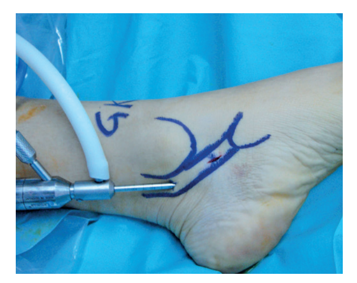
Figure 1. Surgical reference for tendoscopy of the PT. A. The path of the PTT is examined and marked on the skin using the medial malleolus and the scaphoid bones as the reference.