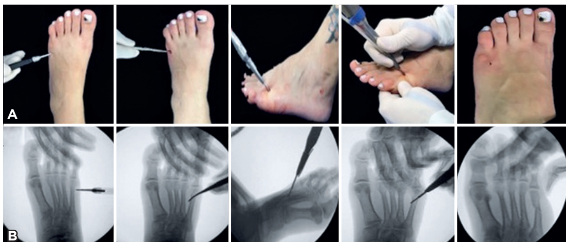
Figure 1. Intraoperative sequence of the surgical technique; A) Clinical image; B) Radiographic image.

The osteotomy was performed by moving the burr from lateral to medial. During osteotomy, with the non-dominant hand, the surgeon applied external manual pressure to the distal fragment in a medial direction. After completion of osteotomy, the distal part of the fifth metatarsal migrated medially with correction of the deformity (Figure 1).