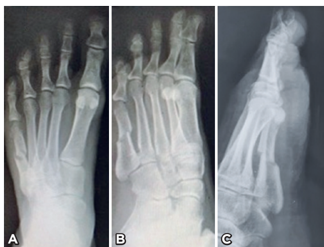
Figure 2. Radiograph obtained at postoperative week 6. A) Anteroposterior view. B) Oblique view. C) Lateral view, highlighting the obliquity of osteotomy and contact between fragments.

A challenge posed by unfixed osteotomies used to treat fifth metatarsal deformity is the risk of developing transfer metatarsalgia. Although unfixed osteotomy offers the advantage of no hardware, dorsal migration of the distal fragment can occur, and the load can be transferred medially. Kea-