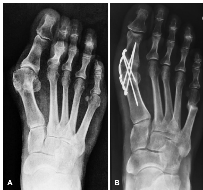
Figure 1. A. Pre and B. Postoperative radiographs.