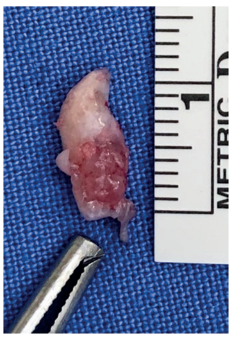
Figure 5. Excised specimen from nailbed of second toe.