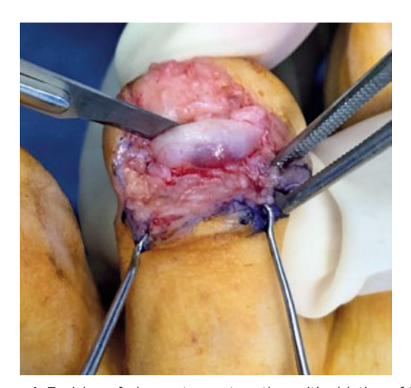
Figure 4. Excision of glomus tumor together with ablation of the nailbed.