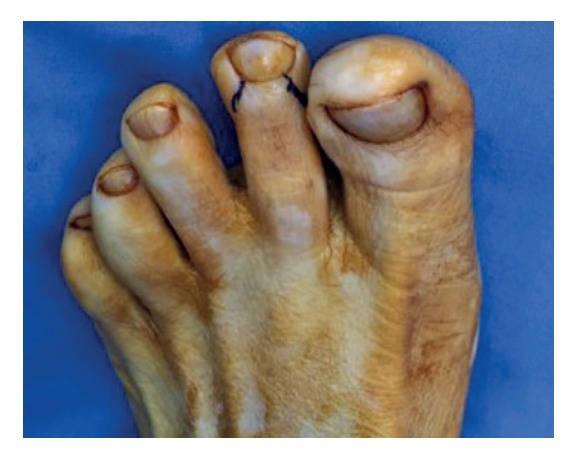
Figure 2. Planned skin incisions for elevation of cuticle.