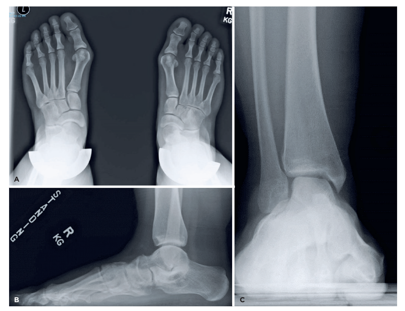
Figure 2. (A) AP bilateral foot radiographs and (B) lateral view of the right foot demonstrating severe flatfoot, forefoot abduction, dysplastic talar head/neck, and indirect signs of tarsal coalition (C-sign and dorsal talar beak). (C) AP view of the right ankle demonstrating mild valgus talar tilt.

Under fluoroscopic guidance, an oscillating saw was used to perform the osteotomy connecting the two markers. In this specific case, as a severe hindfoot valgus existed and a SJ fusion was planned, once the talus and calcaneus were separated