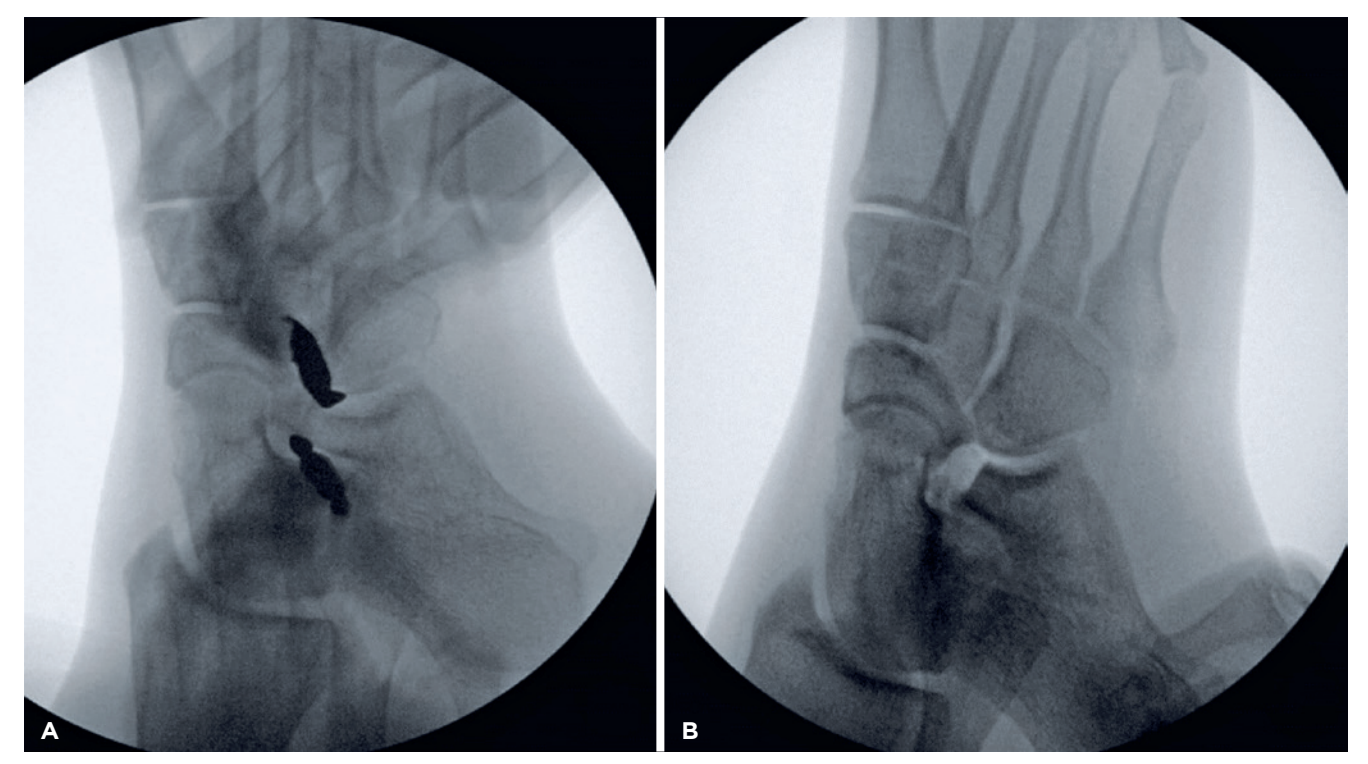
Figure 1. Intraoperative fluoroscopic views of prior surgical treatment of calcaneonavicular coalition, (A) before and (B) after resection.

An extensive medial foot approach was selected and performed along the trajectory of the posterior tibial tendon (PTT), from the medial malleolus down to the navicular tuberosity. The tendon was exposed and found to be intact pro-