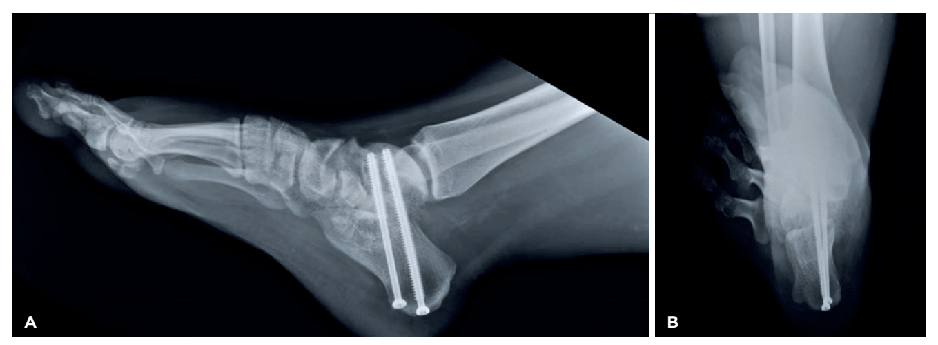
Figure 7. (A and B) Postoperative non-weightbearing radiographs demonstrating the correction achieved on lateral and hindfoot alignment views, with adequate apposition of the bone-block arthrodesis and positioning of the hardware, as well as significant correction of the hindfoot and forefoot deformities.

Figure 6. (A) The sagittal saw was used to connect the dots marked by the Freer elevators and, later, the osteotomy line in the calcaneus was extended distally to the plantar aspect of the calcaneocuboid joint to free up the residual calcaneonavicular coalition. (B) Fluoroscopic view. The bone block (12-mm lateral-based trial wedge) is inserted, and its alignment checked. (C) Fluoroscopic view of the bone block allograft in place and secured with two guidewires for 5.5-mm cannulated screws. (D) Fluoroscopic view of the 6-mm trial wedge for Cotton osteotomy correcting the residual forefoot supination. (E) Final lateral fluoroscopic view after insertion of the Cotton osteotomy wedge allograft. (F and G) Final fluoroscopic calcaneal axial and anterior ankle views demonstrating adequate hardware positioning.