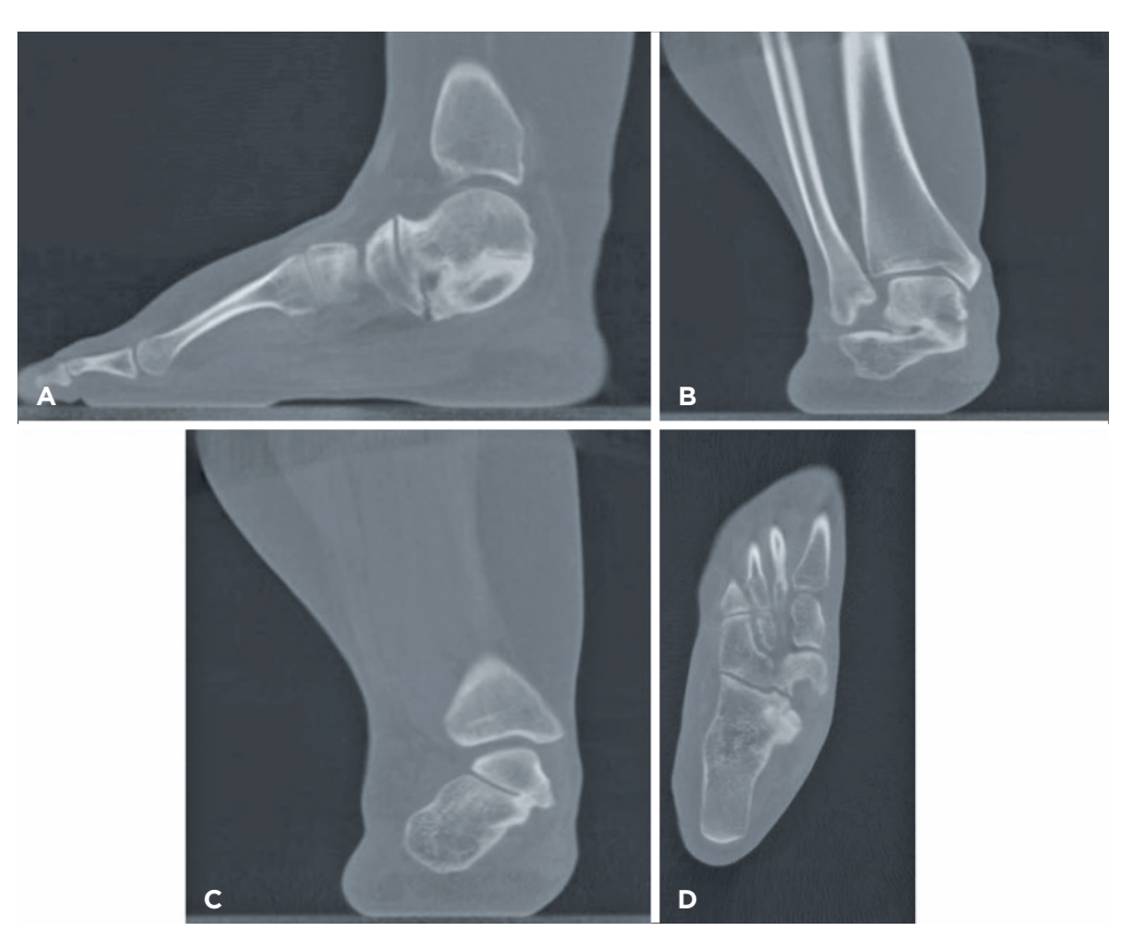
Figure 3. (A) Weightbearing CT (sagittal view). Talocalcaneal and calcaneonavicular (residual) coalitions. (B) Weightbearing CT (coronal view). Subtalar joint middle facet coalition. (C) Weightbearing CT (coronal view). Severe hindfoot valgus (approximately 45°). (D) Weightbearing CT (axial view). Residual calcaneonavicular.