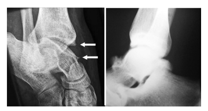
Figure 1. Oblique and lateral radiographs of the ankle. Tibial and talar osteophytes

Tibial and talar osteophytes were surgically resected in all patients. Radiographs were taken postoperatively to control for exostoses (Figure 6).