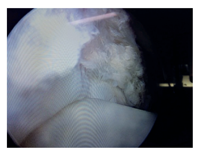
Figure 5. Removal of tibial osteophyte