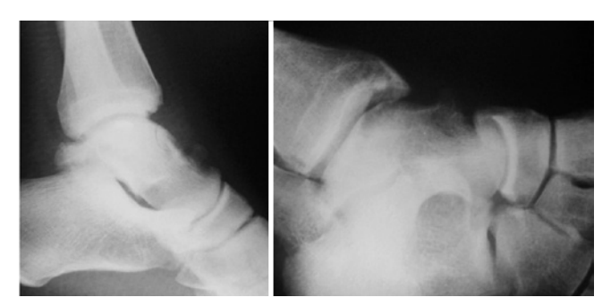
Figure 6. Postoperative lateral and oblique radiographs of the ankle.

Patients started weight-bearing on postoperative day 2. Sutures were removed on day 10. Rehabilitation was performed for 2 months. All patients returned to their daily activities at a mean of 3.8 weeks after surgery. Athletes returned to sport-specific training at a mean of 2.1 months after surgery. The American Orthopaedic Foot and Ankle Society (AOFAS) score improved from 73 preoperatively to 95 postoperatively. All patients had relief of symptoms, were satisfied with the surgical procedure and were willing to recommend it to others. No complications were reported.