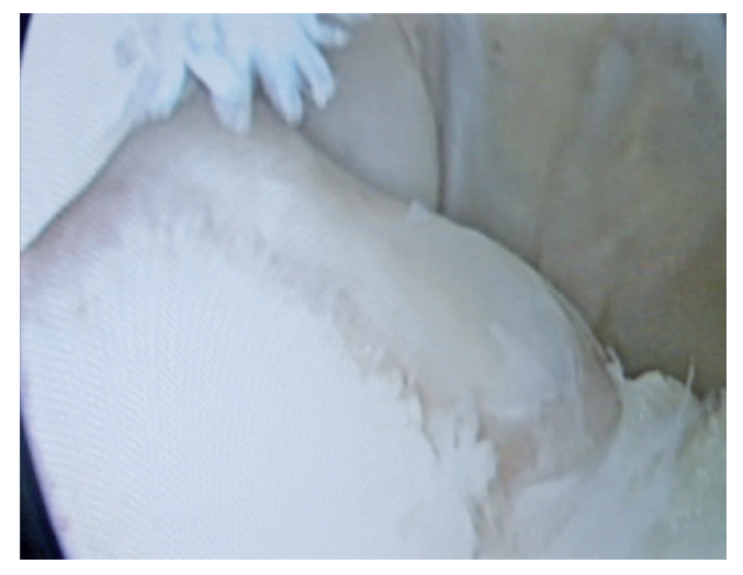
Figure 3. Arthroscopy. Talar osteophyte.