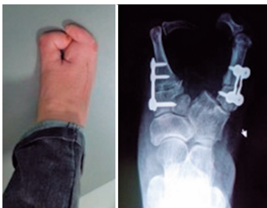
Figure 3. Photo and X-ray of patient's right foot at 6 postoperative months.

Surgical correction was first performed on the foot that caused the most inconvenience to the patient. In the first stage, two different procedures were performed on the right foot. A tourniquet was applied with the patient in a supine position, and a 5cm medial incision was made over the first tarsometatarsal joint. After careful dissection and protection of the extensor tendons, closing base lateral wedge osteotomy was performed on the first metatarsal, which was fixed to the first cuneiform bone using a plate and screws in a modification of the Lapidus procedure. A 10cm lateral incision was then made, and after protecting the extensor tendons, the authors performed an en bloc excision of the fourth metatarsal using a periosteotome, followed by a medial wedge osteotomy of the fifth metatarsal, and fixation with plate and screws. The access openings were closed with absorbable multifilament sutures for subcutaneous closure and nonabsorbable monofilament suture for skin closure. The patient was asked to wear Barouk shoes and allowed to bear weight as tolerated.