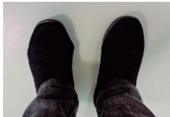
Figure 4. Postoperative comparison of shoes on both feet of the patient.

There is no consensus on the surgical management of cleft foot deformity. Due to the rarity of this pathology, few publications have discussed its surgical treatment; moreover, all but one of the articles published on the topic concern the treatment of children (6-10) .