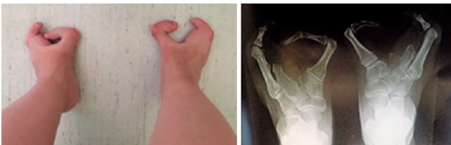
Figure 1. Photo and AP X-ray of the patient's feet.

Her American Orthopedic Foot and Ankle Society (AOFAS) score was 72 out of a possible 100. Anteroposterior and lateral standing X-rays revealed the presence of only two rays in each foot (type V according to the Blauth W. and Borisch N.C. classification) (Figure 3). There was no axial deviation of the ankle.