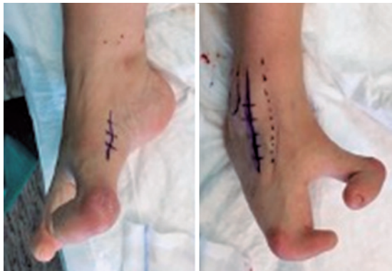
Figure 2. Medial and lateral approaches for the modified Lapidus procedure, basal fifth metatarsal osteotomy, and removal of the hypoplastic fourth metatarsal.