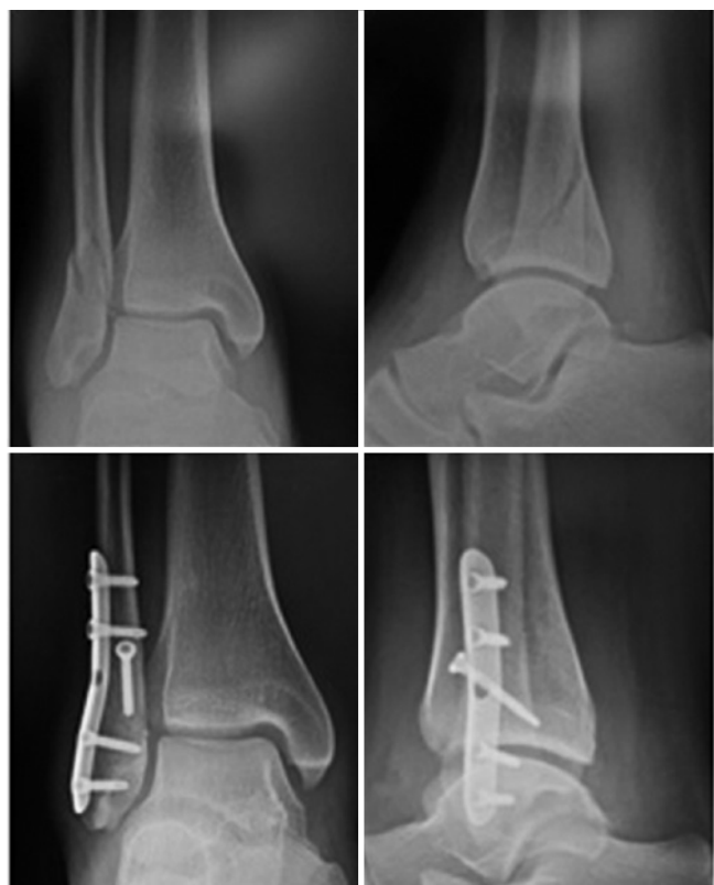
Figure 2. Treatment of transyndesmal fibula fractures with locked plates.