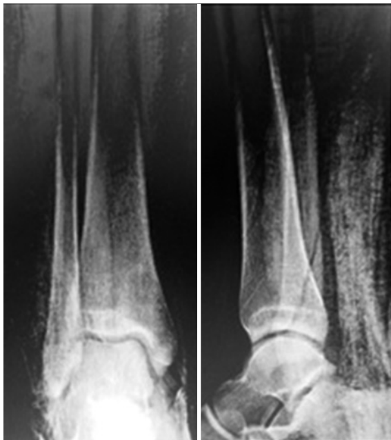
Figure 1. Image showing a 44-B1 fracture with no displacement that could be conservatively treated.

The project was performed under the ethical standards that regulate investigation in humans, according to the National Personal Data Protection Act No. 25326 (Habeas Data Act) and Declaration of Helsinki in its latest version.