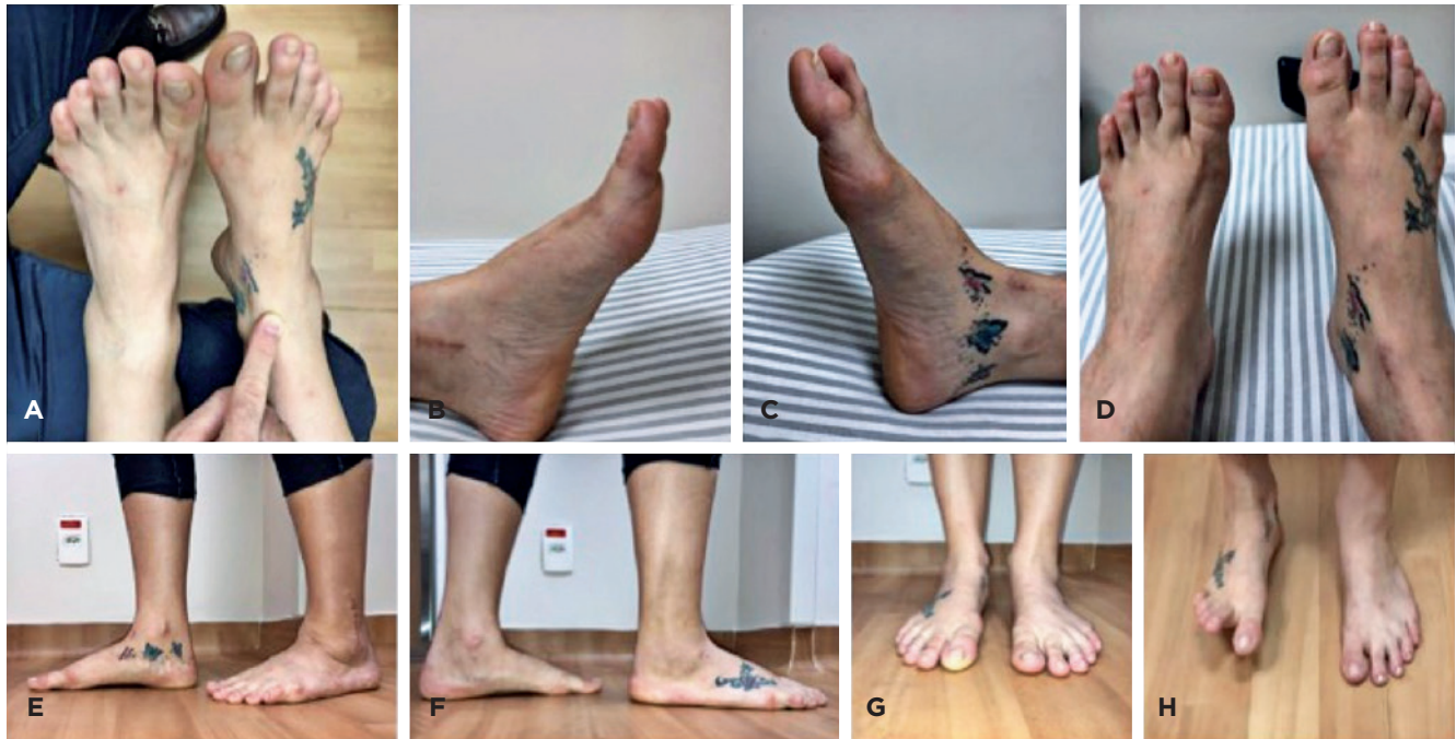
Figure 1. Preoperative clinical photographs.