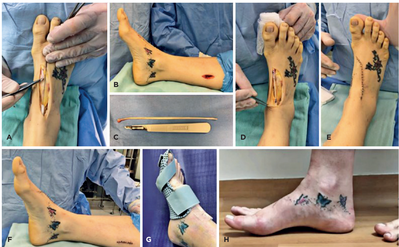
Figure 2. Intraoperative and postoperative photographs.