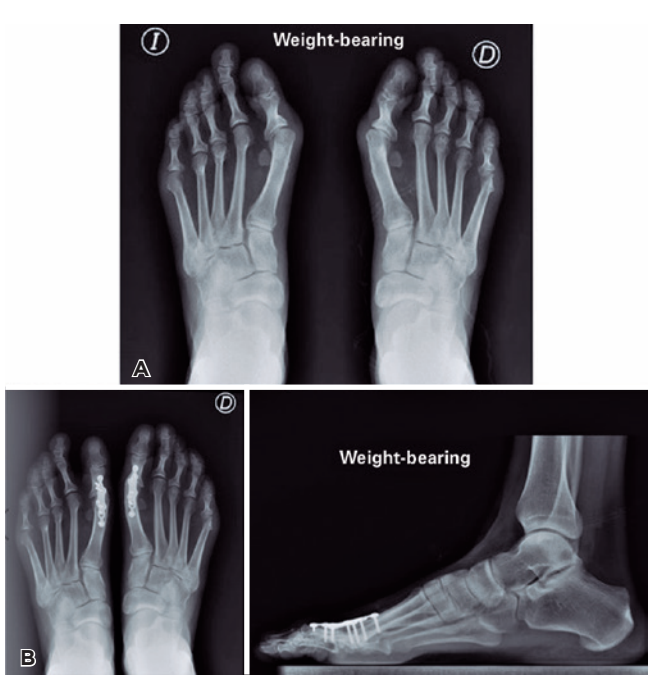
Figure 1. A) A 42-year-old patient who presents hallux rigidus secondary to percutaneous forefoot surgery with severe degenerative changes and joint incongruence. B) Final radiological outcome after arthrodesis with dorsal plate and concave-convex reaming with proper position both in frontal and sagittal planes.

It is important to maintain a mobile interphalangeal joint for the success of intervention. Arthrolysis may also be performed if necessary.