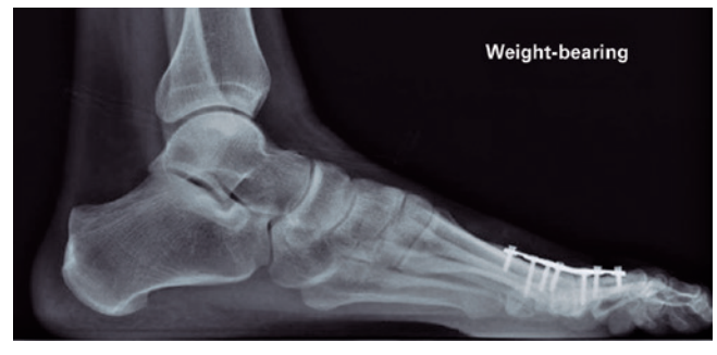
Figure 3. Protrusion of locked screws from a dorsal plate.