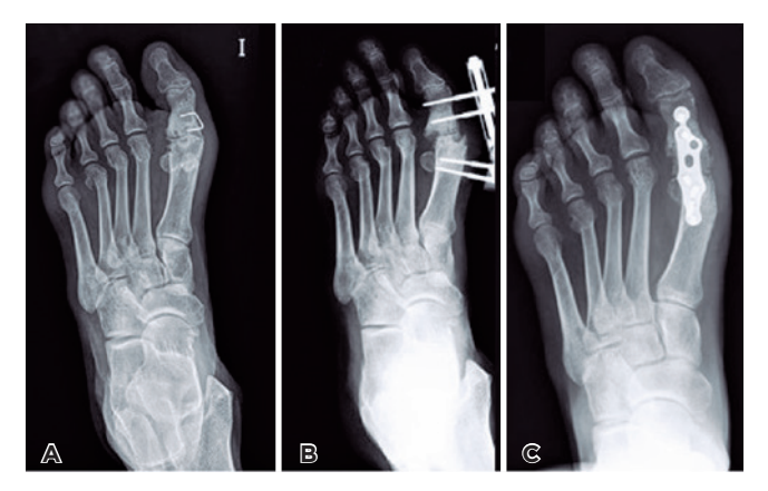
Figure 2. Technique of two-stage distraction arthrodesis for hallux rigidus as a sequel of Keller-Brandes-Lelievre intervention in a 29-year-old patient. A) initial x-rays. B) first stage of arthrodesis with monolateral Hoffman minifixator. C) final outcome after placement of a cortico-spongy graft and osteosynthesis with a revision dorsal plate.

Since desired elongation is achieved, a new intervention is conducted after 2-3 weeks, with the removal of fixator through the same incision, resection of fibrous tissue remnants, and