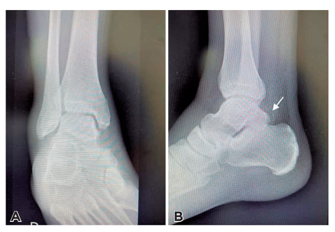
Figure 2. Preoperative A) anteroposterior and B) lateral radiographs of the right ankle, showing suspicious findings on the posteriomedial aspect of the talus (arrow).

There have been few reports of Cedell fracture in the literature<sup>(3)</sup>. This fracture is most commonly described as an avulsion injury resulting from a pronation-dorsiflexion force causing tension at the insertion of the posterior talotibial ligament. Most cases have been attributed to this indirect effect<sup>(1,3,5)</sup>. Nevertheless, the injury may occur as a result of an inversion and a forced plantarflexion mechanism leading to direct compression of the posterior talus, as seems to have occurred in our patient(6,7). This mechanism of injury on landing may explain the vertical compressive force and splitting