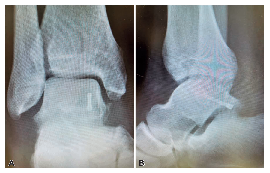
Figure 6. Postoperative radiographs obtained at 4-week follow-up. A) Anteroposterior and B) lateral radiographs of the right ankle.

of the posterior talar process at the base of the posteromedial tubercle in the present case. These fractures could be misdiagnosed as severe ankle sprains, mostly due to poor visualization on routine radiographs. Timely diagnosis and treatment of such an injury is of great importance in restoring subtalar joint anatomy and function, as minimal displacement can lead to posttraumatic arthritis, painful nonunion, or posterior impingement<sup>(2,8,9)</sup>. The real challenge is to choose appropriate treatment after recognizing a Cedell fracture. To the author's knowledge, and according to a recent review, there have been few descriptions of surgical techniques for this type of fracture, consisting mainly of case reports<sup>(3)</sup>. Most