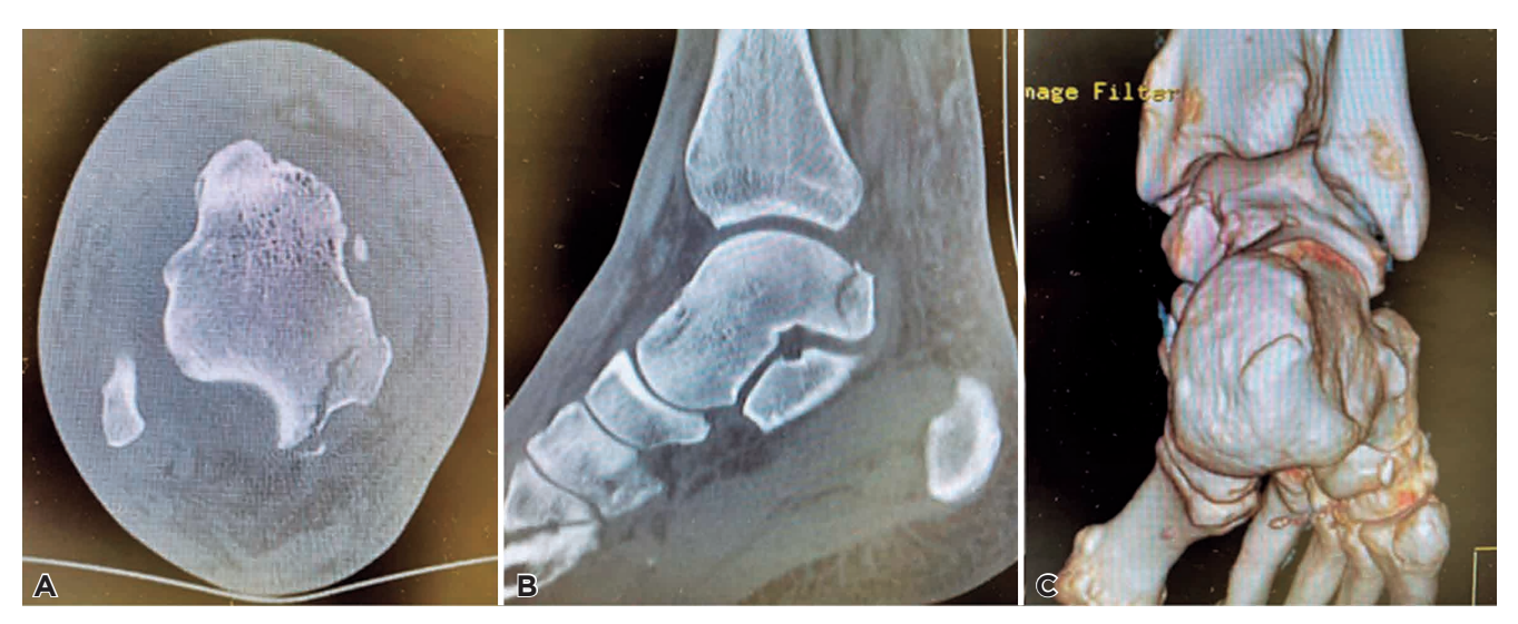
Figure 3. Preoperative computed tomography showing a displaced posteromedial talus fracture (arrow). A) Transverse view; B) sagittal view; C) 3-dimensional reconstruction.