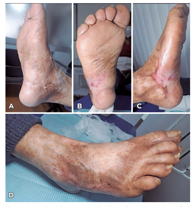
Figure 2. Final result. A-D) Total healing of complicated DF after nine months of DF salvage protocol.

Among outpatient indications, oral antibiotic therapy was indicated to treat the soft tissue infection (ciprofloxacin and clindamycin/three weeks according to the previously described cultures for sensitive gram-positive and negative bacteria), insulin therapy, analgesia, and the use of physical aids (crutches) to support walking, besides avoiding bearing weight on the affected limb and providing timely pressure relief for optimal healing of the DF. Finally, ten months after salvage intervention, the limb regained full integrity and amputation was avoided (Figure 2). Currently, the patient continues with her outpatient controls by outpatient consultation and under constant functional rehabilitation of the limb. Patient is currently able to walk 150–300 meters in approximately 10-15 minutes.