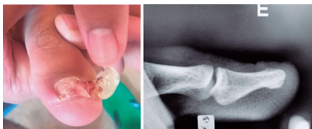
Figure 5. Two months postoperative.