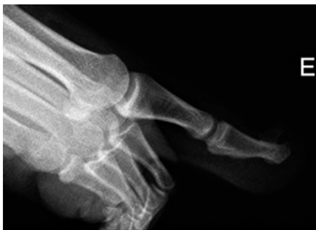
Figure 2. Left hallux radiograph.