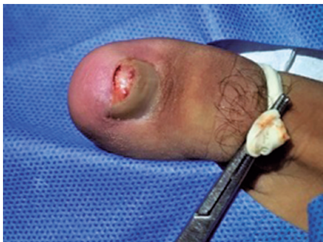
Figure 1. Subungual lesion of the left hallux at the time of the first biopsy by superficial scraping.

The patient evolved well, with good wound healing and no lesion recurrence to date (Figure 5).