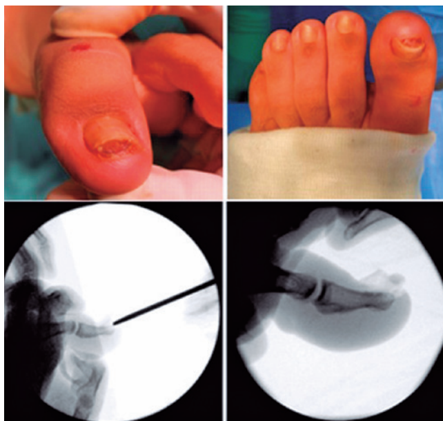
Figure 3. Steps of the surgical approach.

Subungual tumors of the hallux are uncommon lesions that present a wide spectrum of differential diagnoses, such as subungual exostosis, subungual osteochondroma, BPOP or Nora's lesion, superficial acral fibromyxoma, glomus tumor, onychomycosis, and pyogenic granuloma. The patient can seek help in different areas of medicine, such as dermatology, orthopedics, and oncology, or from non-medical health professionals, such as podiatrists. Therefore, varied approaches