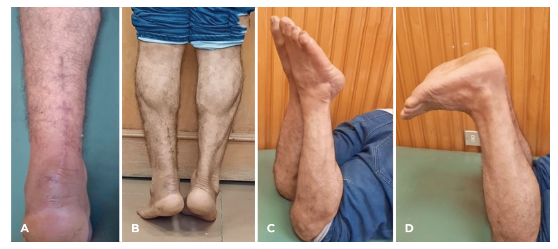
Figure 4. Clinical photos at final follow-up visit; (A) wound scar, (B) double heel rise revealing no visible subcutaneous tethering or bounce all over the tendon, (C and D) active ankle plantarflexion and dorsiflexion.

2°. The ankle plantarflexion strength<sup>(8)</sup> measured with the microFET*2TM digital handheld dynamometer<sup>(9)</sup> (HOGGAN Industries, Inc., West Jordan, UT, USA) was 534.5 Newtons (N), or 96.4% of the normal side (554.5 N). The maximum calf circumference was assessed using flexible tape in a sitting position with the knee and ankle at a right angle and the feet resting on the floor, at 15 cm below the medial joint line. The calf circumference was 42.5 centimeters with 1.8 centimeters lower than the sound limb. One year after surgery, MRI imaging confirmed the TA integrity and full healing with increased diameter of the repaired tendon (Figure 5).