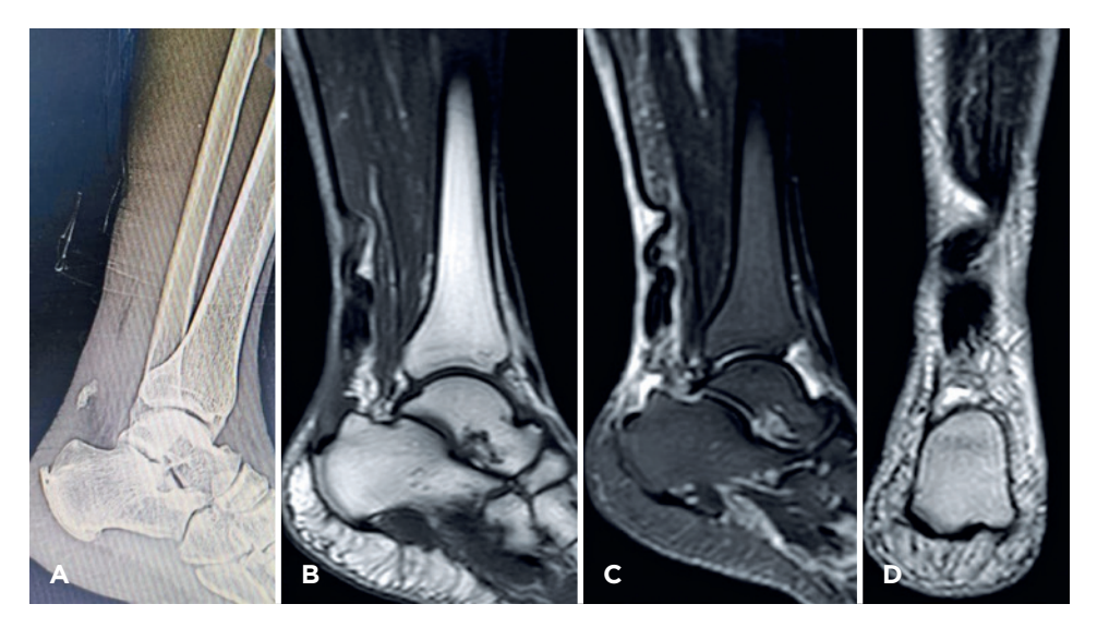
Figure 1. Lateral ankle radiograph (A) shows Tendoachilles avulsion injury from calcaneal insertion. MRI images: sagittal T1 (B), sagittal fat suppression (C), and coronal (D) slices reveal Tendoachilles insertional tear with tendon retraction.

Next, the AM that had been previously placed was stretched over the entire exposed length of the repaired tendon and wrapped around the Tendoachilles (Figure 3). Using absorbable Vicryl 2-O sutures, the AM was carefully sewn into the tendon, stretching both the insertional site and the entire length of the exposed tendon. Any excess AM was then excised. Any paratenon remnants were then approximated with the same absorbable sutures. After the tourniquet