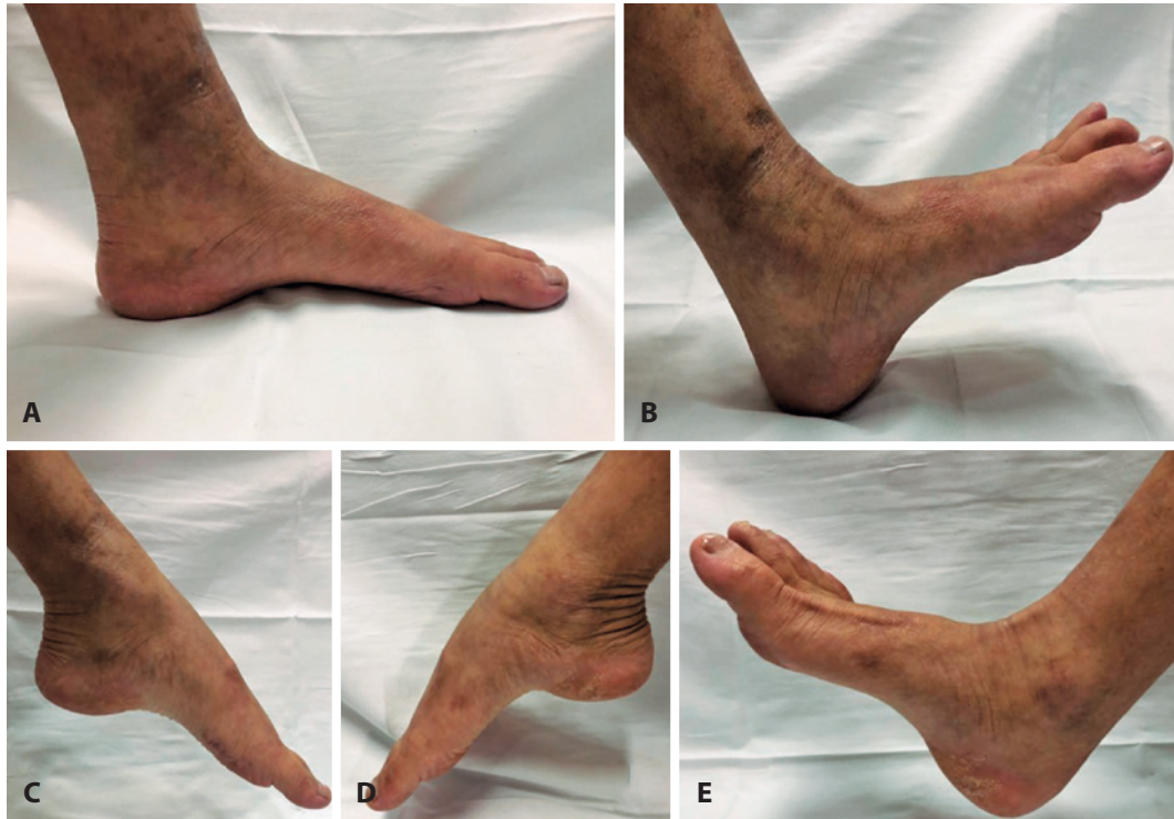
Figure 6. Clinical exam at 24 months of postoperative demonstrates a (A) straight position of the hallux while standing and no signs of recurrence in (B) dorsiflexion and (C) plantarflexion compared to the contralateral foot (D and E).