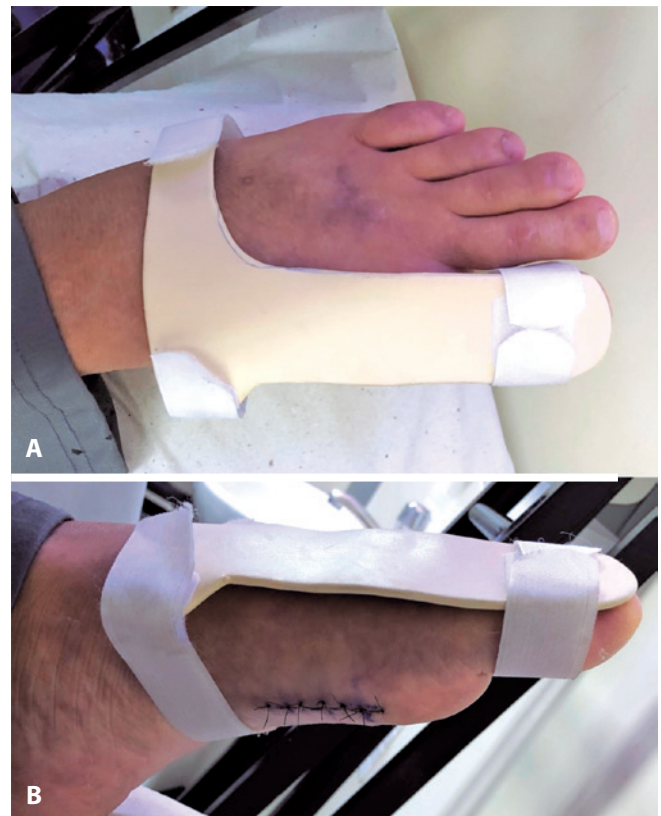
Figure 5. (A) dorsal and (B) lateral view of the custom-made thermoplastic splint. It is placed on the dorsal site of the hallux crossing both IPJ and MPJ to keep the toe straight and it also protects the suture, avoiding extension of the hallux.

for 6 weeks. After 2 weeks of surgery, no wound complications were observed, suture stitches were removed and active plantarflexion exercises were oriented but without taking the CTS out. The use of the CTS kept the toe straight and avoided extension movements of the hallux preventing excessive tension to the suture. The early mobilization granted by the CTS reduced the chance of scar adhesions and the fact that it gave condition for early FHL activation a reasonable functional outcome was observed. Patient was instructed to always maintain the CTS except for hygiene purposes. At 6 weeks, CTS was removed, and progressive weight bearing was allowed. At that time, physical therapy program started to progressively restore proprioception and strengthening. On the latest follow-up visit at 24 months of the surgery, we haven't noticed partial or total recurrence of the deformity, loss of range of motion and weakness of plantarflexion of the hallux (Figure 6). Patient was asymptomatic and fully active.