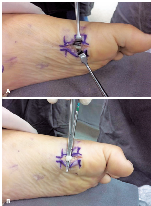
Figure 2. Forefoot medial approach with (A) dissection and (B) exposure of the FHL tendon.

The procedure was performed under regional anesthesia with the patient positioned in a supine position. Prophylactic antibiotic was administered. The preference of the authors was not to use a thigh tourniquet. A longitudinal medial approach of 2-3cm parallel to the ground was performed between the dorsal and plantar skin of the hallux, running posteriorly from the proximal edge of the medial sesamoid bone (Figure 1C and D). The subcutaneous tissue was dissected, and the abductor hallucis tendon exposed. Care was taken to avoid damage of the sensitive plantar-medial nerve of the hallux. We pulled the abductor tendon up and visualize the FHL immediately proximal do the sesamoid sulcus (Figure 2). With the FHL