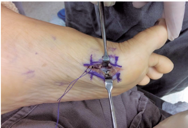
Figure 3. With the ankle and hallux at maximum dorsiflexion, a Z-tenotomy with 2cm in length is performed. The proximal stump of the FHL is sutured to prevent its retraction.

at sight, we placed the ankle and hallux at maximum dorsiflexion for a Z-tenotomy with 2cm in length (Figure 3). To avoid distal stump from retracting we sutured it with a No.2 Vicryl. Then, we kept passively dorsiflexing both to restore physiological range of motion of the IPJ and MPJ. The distal and proximal stumps of the FHL were sutured with a No.2 Nylon using the modified Kessler technique (Figure 4). The incision was closed in layers, using a No.3 Monocryl for subcutaneous tissue and a No.4 Nylon for the skin. A sterile soft dressing was applied to the surgical wound, and a custom-made thermoplastic splint (CTS) was placed on the dorsal site of the hallux crossing both IPJ and MPJ to keep the toe straight (Figure 5). Postoperatively, patient remained non-weight bearing with the CTS