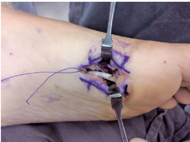
Figure 4. The distal and proximal stumps of the FHL are sutured with a No.2 Nylon using the modified Kessler technique.

for 6 weeks. After 2 weeks of surgery, no wound complications were observed, suture stitches were removed and active plantarflexion exercises were oriented but without taking the CTS out. The use of the CTS kept the toe straight and avoided extension movements of the hallux preventing excessive tension to the suture. The early mobilization granted by the CTS reduced the chance of scar adhesions and the fact that it gave condition for early FHL activation a reasonable functional outcome was observed. Patient was instructed to always maintain the CTS except for hygiene purposes. At 6 weeks, CTS was removed, and progressive weight bearing was allowed. At that time, physical therapy program started to progressively restore proprioception and strengthening. On the latest follow-up visit at 24 months of the surgery, we haven't noticed partial or total recurrence of the deformity, loss of range of motion and weakness of plantarflexion of the hallux (Figure 6). Patient was asymptomatic and fully active.