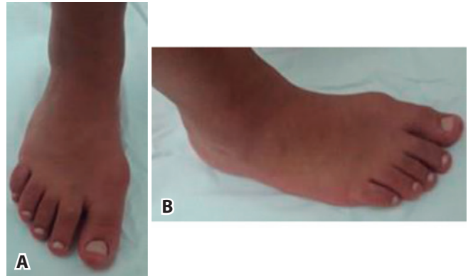
Figure 1. Clinical aspect of the right foot. Front view (A) and oblique view (B) demonstrating valgus of the hallux and edema between the first and second rays at the level of the Lisfranc joint.