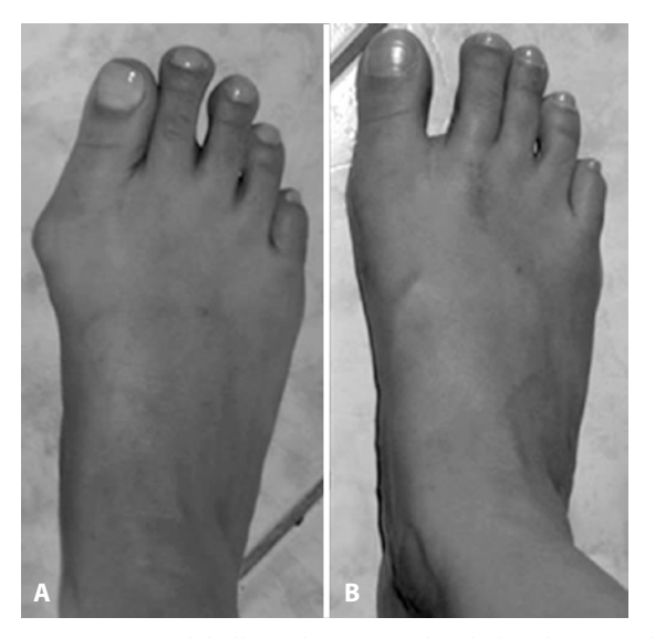
Figure 4. Patient with hallux valgus treated with the Chevron, Akin and Weil techniques. 1. Pre-operative clinical evaluation. 2. Postoperative clinical evaluation.

When evaluating 112 feet over ten years, Schneider et al.<sup>(12)</sup> demonstrated good results with the Chevron technique alone, with a final AOFAS score of 88.8, showing significant improvements in the metatarsophalangeal and first