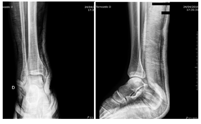
Figure 4. Post-reduction control radiography

weeks after the injury, the patient started using partial support with a brace (Robofoot) and crutches for another 4 weeks and then started full support without using a brace, in conjunction with gait training and active and passive mobilization to gain/maintain a range of motion during physical therapy. At this stage, a control X-ray and MRI were obtained to investigate the associated injuries. The examination conducted three months after the injury (Figure 5) illustrated diffuse subchondral periarticular effusions in the ankle bones with a mottled aspect, which is compatible with reflex dystrophy, and a complete rupture of the anterior and calcaneofibular talofibular ligaments as well as the deep tibiotalar section of the deltoid ligament complex and a small anterior tibiotalar articular effusion and posterior subtalar effusion, with signs of synovitis. In the physical examination performed 14 weeks after the injury,