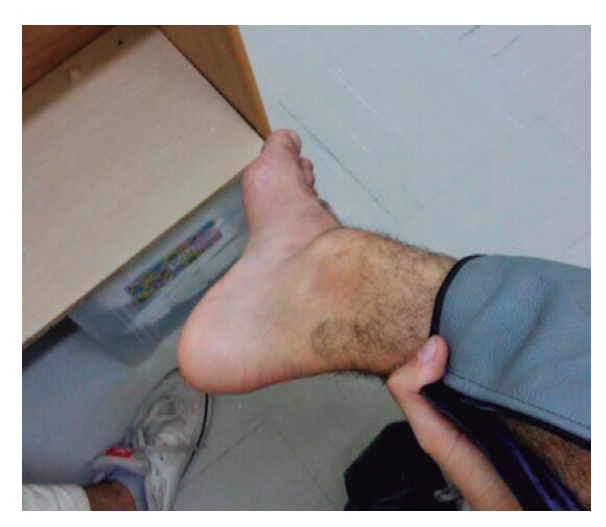
Figure 2. Ankle deformity in hospital care

During the follow-up, the patient used immobilization in a neutral position and load restriction for six weeks. Seven