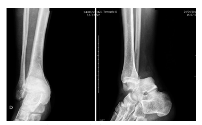
Figure 3. Radiographic study showing posterior pure tibiotalar dislocation