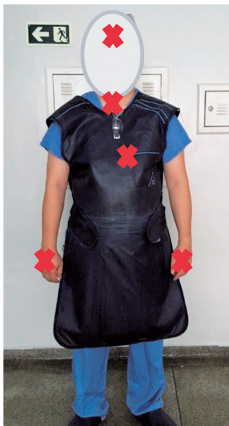
Figure 1. Critical target areas (highlighted in red) for monitoring the physician.

An evaluation of the professional's workday, bibliographic research, and legislation provided the methodological basis for monitoring 5 (5) critical target areas (Figure 1): right hand and left hand (dose at the limbs), neck (thyroid), forehead (lens) and thorax (total body). The points selected were monitored outside the personal radiological protection equipment (lead apron with 0.50mm lead (Pb) equivalent from NMartins®) used by the professional so that the dosimeter could sense a significant amount of radiation. Radiological protection equipment was not used on the hands, neck or eyes.